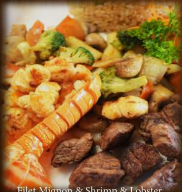
Filet Mignon & Shrimp & Lobster