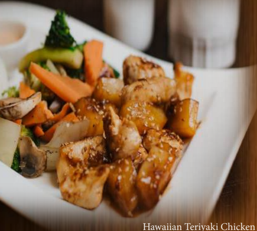
Hawaiian Teriyaki Chicken